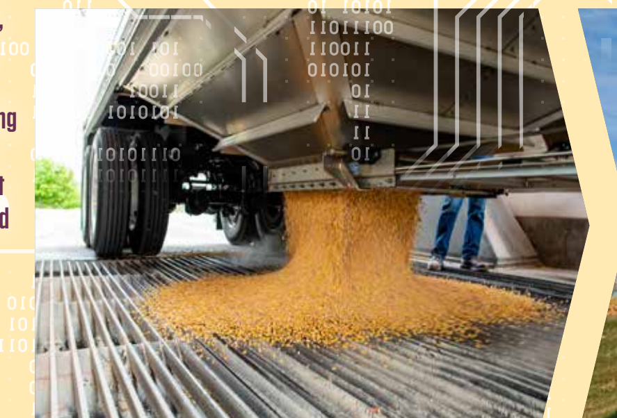
As crops are harvested and delivered to local co-op elevators, crop quality and quantity are tracked and storage use is instantly updated. Digital dashboards allow locations to see grain being received, stored and delivered across the system.

At every step, the physical 100 CHS supply chain is adding data-driven tools to boost efficiency and add value.